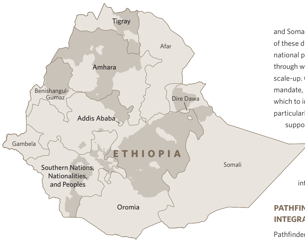
FIGURE 1: IFHP OPERATIONAL WOREDAS, 2011

contraception; promotion of dual method use; provision of condoms and other contraceptives according to training and availability; accurate information about all contraceptive methods; counseling for women or couples with HIV who desire a safer pregnancy; and referrals for contraceptive methods that the provider is not able to directly offer.