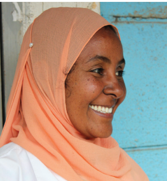
HIV Care and Treatment Provider.