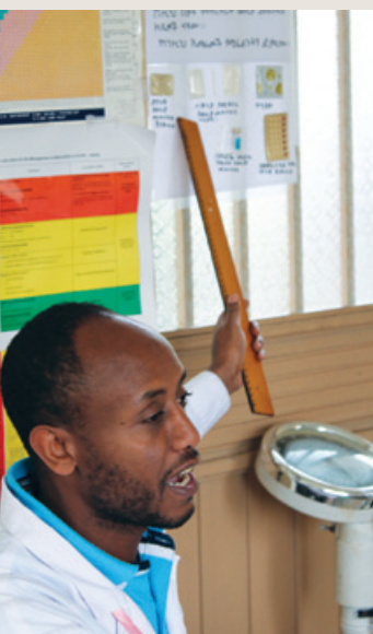
HIV Care and Treatment Provider Describes FP Options.

The SC guide recommends that, if FP or HIV services are not available on site, programs should identify where the services are available, establish collaborative