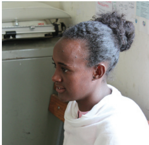
A client discusses FP with her ART provider.