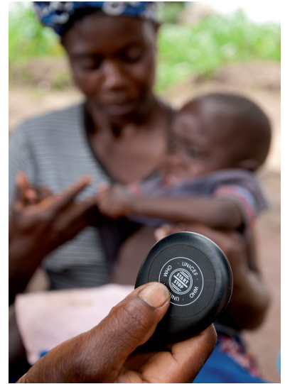
CHW in Zambia measures the respiratory rate of a child using a timer

Community-based interventions for health, such as integrated community case management (iCCM), increase access to care and have potential to reduce child mortality by reaching marginalised populations. Through training, the use of effective clinical algorithms and active supervision, they offer an opportunity to improve rational use of antibiotics and limit the development of drug resistance in resource-poor settings. This study provides evidence on rational use of antibiotics for treatment of pneumonia symptoms to inform future implementation of iCCM, safeguarding effectiveness of current treatments whilst continuing to maximise access to care.